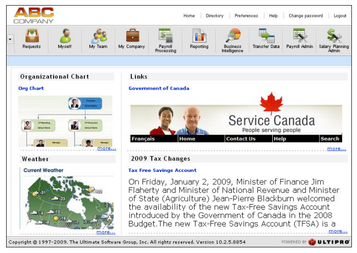
The UltiPro portal connects your entire organisation by providing each employee with access to corporate information and self-service.

UltiPro's Web portal keeps everyone in your organisation connected. Your gateway to business activities, the UltiPro portal provides essential information for administrators, HR/payroll staff, management team, and employees, and allows your workforce to perform routine business activities from one central location. You save time and reduce your administrative workload because managers can complete common employee administrative tasks, administer benefits, manage staff, and access reporting in real-time. Employees can access their own personal information, get questions answered, and complete routine updates instantly. Plus, sharing important company news and business objectives improves communications to your entire workforce.